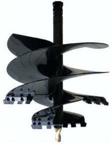
Tree Bits 18" - 36"