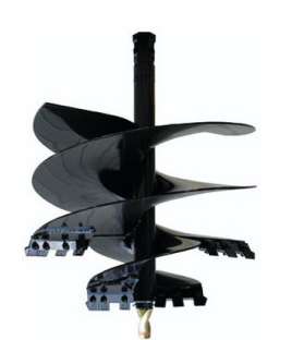
Tree Bits 18"- 36"