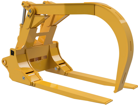
WIDE CLAMP DESIGN