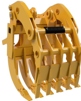
SHOWN WITH TEETH