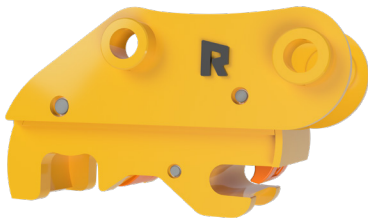
HKR Excavator Coupler