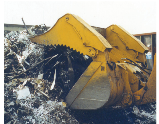
Rockland's DB Demolition Bucket looks tough, and it is tough!

Bolt-on cutting edges and replaceable end bits are standard. DB Demolition Buckets can be equipped with the teeth of your choice.