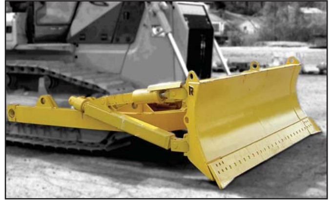
Angle blade, brace group and c-frame.

All Rockland ABL Angle Blades are manufactured from high-strength, weight-saving alloy steels that deliver years of dependable service. Hydraulic tilt struts feature induction hardened, chrome plated, oversized protected cylinder rods with long life, high-pressure seals.