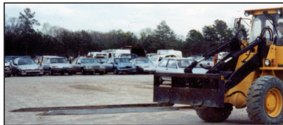
Car Body Forks With Longer Tines

Rockland CBF Car Body Forks are tough and they won't take a bite out of your pocketbook or the maintenance budget. The entire unit is built of tough, weight-saving, alloy steels that deliver years of dependable service. The solid frame also does double duty as a dozer to keep yards level, fill low spots, or keep scrap out of the way. If you handle crushed cars with a loader, specify Rockland CBF Car Body Forks.