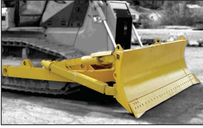
Angle blade, brace group and c-frame.

All Rockland ABL Angle Blades are manufactured from high-strength, weight-saving alloy steels that deliver years of dependable service. Hydraulic tilt struts feature induction hardened, chrome plated, oversized protected cylinder rods with long life, high-pressure seals.